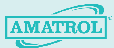
Chart recording is one of the most important skills a student can learn. The T5553-R1A identifies process variables, providing learners with the ability to accomplish work with navigation, digital chart recorder configuration, data transfer, and more, in a precise and effective manner. Amatrol uses components that learners will find on-the-job in order to give the best opportunity to build confidence and industrial competencies.

Amatrol's Three-Channel (T5553-R1A) Data Acquisition Learning System adds to the T5553 Thermal Process Control Learning System to teach the fundamentals of data acquisition. This system consists of equipment used to receive, record, and analyze process data. A chart recorder is one of the most commonly used pieces of data acquisition equipment. Chart recorders create a graphical representation of an electrical input signal received from an input device and provide an on-screen display of the process results.