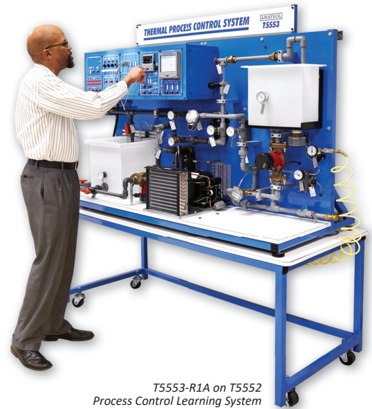
T5553-R1A on T5552 Process Control Learning System

The Data Acquisition Learning System uses real-world components to aid in teaching process variables such as temperature, flow, level and pH, as well as their changes over time. Students will learn how to use chart recorders to collect and display process data. The T5553-R1A includes a Honeywell eTrend chart recorder, Honeywell TrendManager software, 10-Ohm precision resistor assembly, student curriculum and teacher's assessment guide. These technologies augment teaching of process instrumentation, enabling learners to observe what is happening inside the system and more clearly understand the effects of external disturbances and their own adjustments.