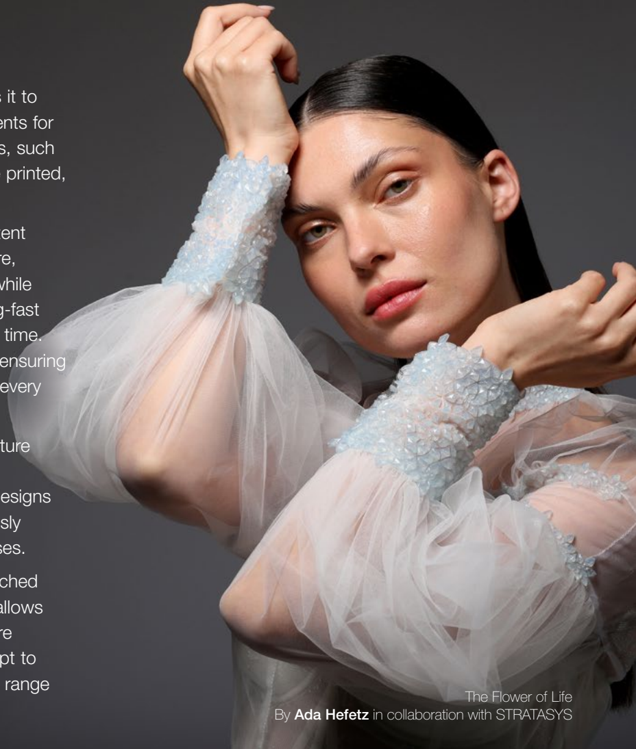
The Flower of Life By Ada Hefetz in collaboration with STRATASYS