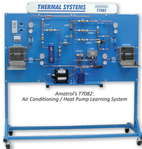
Amatrol's T7082: Air Conditioning / Heat Pump Learning System