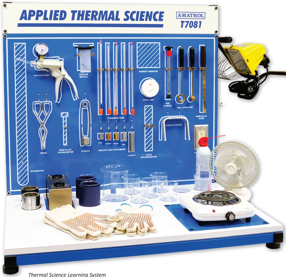
Thermal Science Learning System