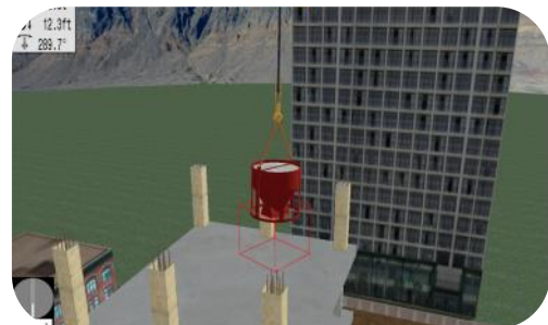
Mastering load movement by positioning concrete buckets at target positions