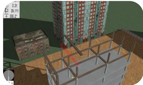
Positioning girders at target positions as part of steel erection