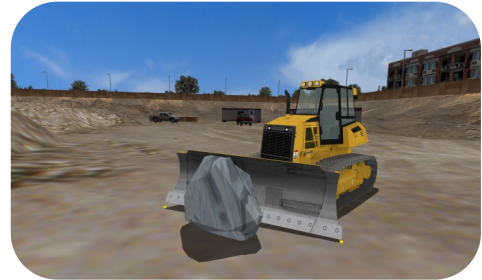
Using the blade to control the path of a boulder