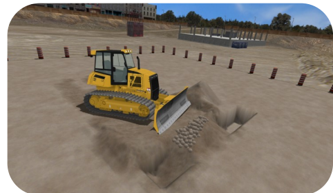
Using the blade to backfill a trench