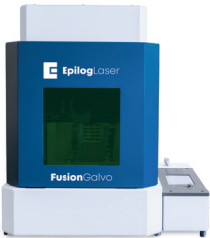
Fusion Galvo G100