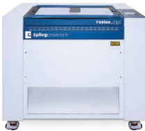
Fusion Edge 24