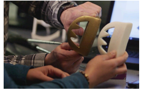
Students in Dunwoody's Engineering Drafting & Design program use the Stratasys F370 3D printer to verify their golf putter design concepts.

At Dunwoody, 3D printing is more than just exposing students to prototyping. It's a powerful tool that teaches the problem-solving skills and collaboration needed to make them valuable assets in the job market. And the Stratasys F370 Printer makes that tool simpler and more cost-effective to use.