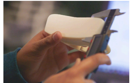
Students verify and refine their product designs with accurate, durable 3D printed prototypes.